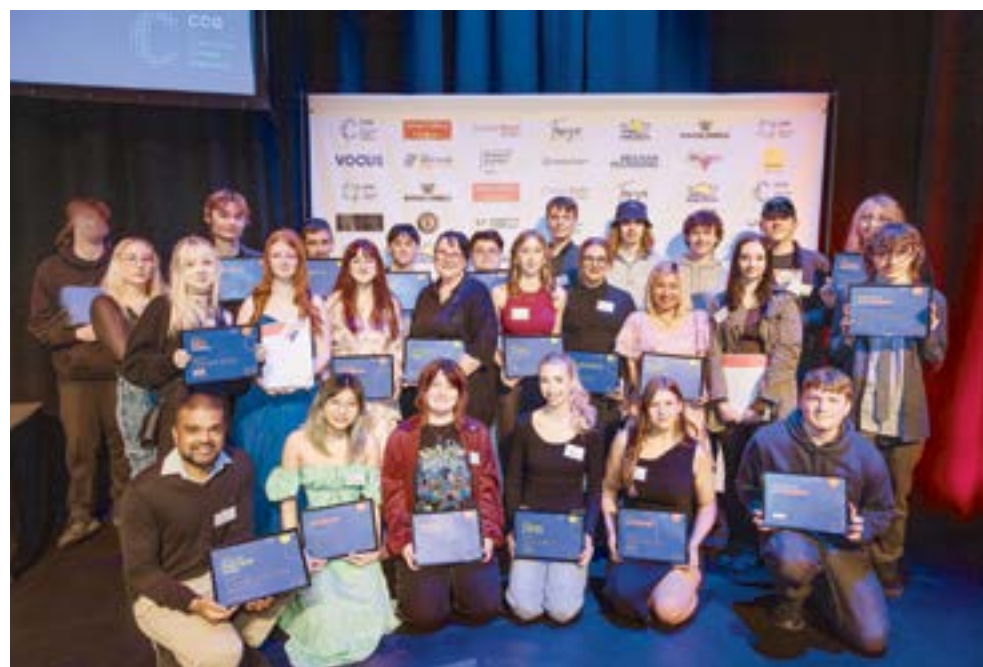
ECG Secondary College shine at the 2025 CCG Awards Ceremony.