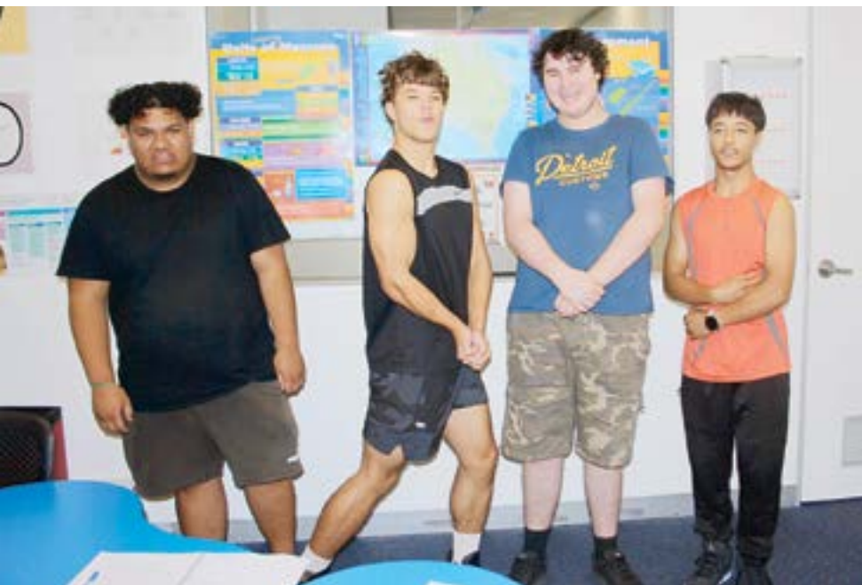
Celebrating Inclusive Learning at ECG

Discover how ECG can support your young person's journey by visiting ecg.vic.edu.au/ enrol-with-us or contacting (03) 5622 6000 or info@ecg.vic.edu.au .