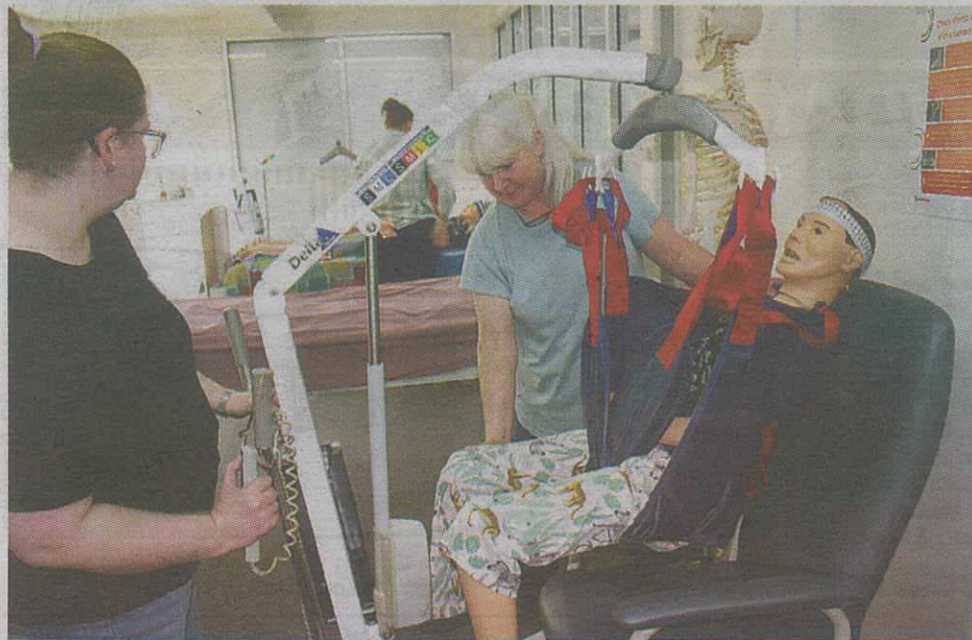
Community College Gippsland Individual Support students practising in class.